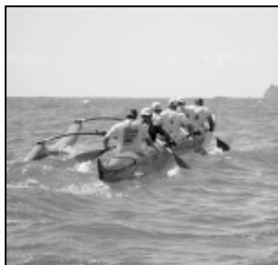
Team New Zealand/Hawaii